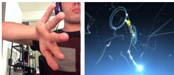
Figure 3 – Hand on side

When the hand is tilted completely on its side, the controller is unable to detect it, as shown in Figure 3.