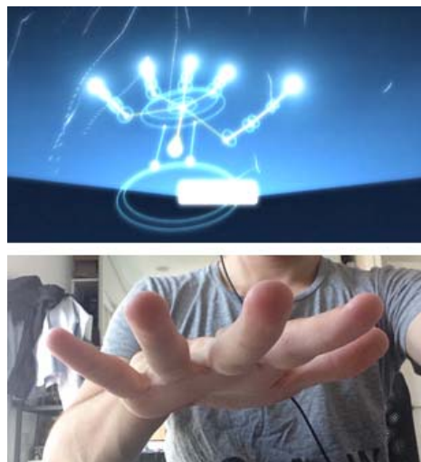
Figure 1 - Leap API output data

A strength of the Leap Motion controller is the accurate level of detail provided by the Leap Motion API. The API provides access to detection data through a direct mapping to hands and fingers. Data provided by the API is determinate in that a client application does not need to interpret raw detection data to locate hands and fingers.