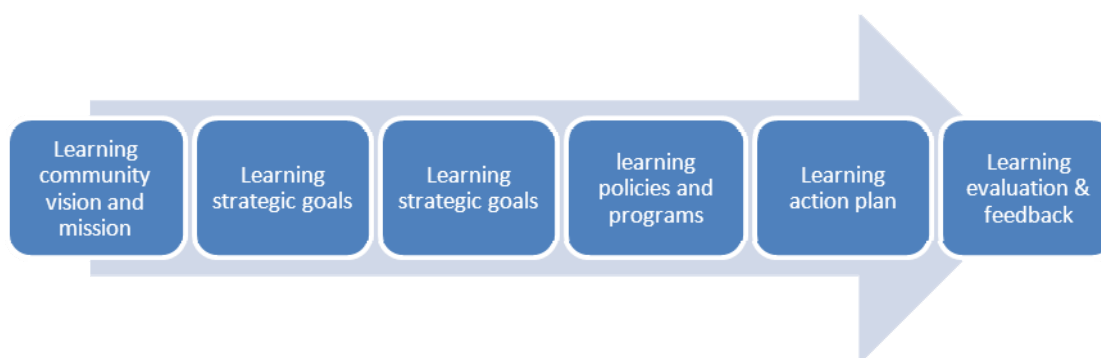
Figure 1. Organizational learning process

6. Integrate resources such as staffing, incentives and maintain new knowledge abilities for creation to ascertain its effectiveness; by monitoring and evaluating periodically the organizational learning progress in realizing the intended learning goals to a successful knowledge sharing process (learning evaluation & feedback).