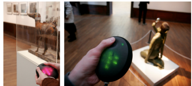
Figure 4. Lega devices being used at the art exhibition

Lega devices are used in groups of 2-5 people. Each person gets their own Lega and moves around the exhibition freely. To make it possible to identify the source of a trace each device is associated with a color that is shown when a trace is found. The Lega constantly records signals from touch sensors and accelerometers. When the indentation on top of the Lega is pressed a trace based on how the Lega has been moved and touched for the past five seconds is transmitted to the infrastructure. This causes the servo-powered button to move down increasing the depth of the indentation, symbolically creating a “lega”. Once the trace has been transmitted to the infrastructure the button resumes its original position. By changing how they move and touch their device different expressions can be created. Currently traces are based on how energetic the movement of the Lega has been and the rate of change in touch sensor activation.