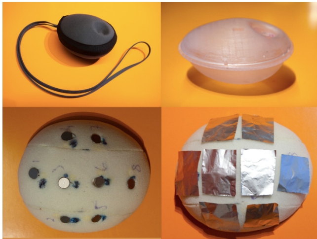
Figure 2. An assembled Lega, the inner shell, vibrator placement, and touch sensor placement.

The top part houses a servo-powered button that is used to alter the depth of the indentation on top of the device. Through a simple modification we were able to read the state of the servo’s internal potentiometer thereby enabling it to also function as a sensor, telling us when the button was pushed. A single layer of cloth to create a seamless appearance covers the whole top, including the button. In addition the thin cloth layer allows light from the multi colored LEDs inside the device to shine through.