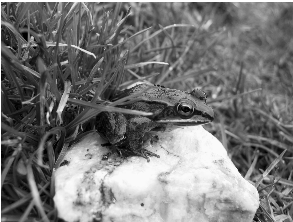
PLATE 1. An adult wood frog traveling through an agricultural field. Amphibians such as the wood frog experience high rates of death when exposed to the application of Roundup both in the aquatic larval stage and in the adult terrestrial stage.

cies in the world. To achieve a general understanding of glyphosate's impacts, we need to expand our information on amphibians both taxonomically and geographically.