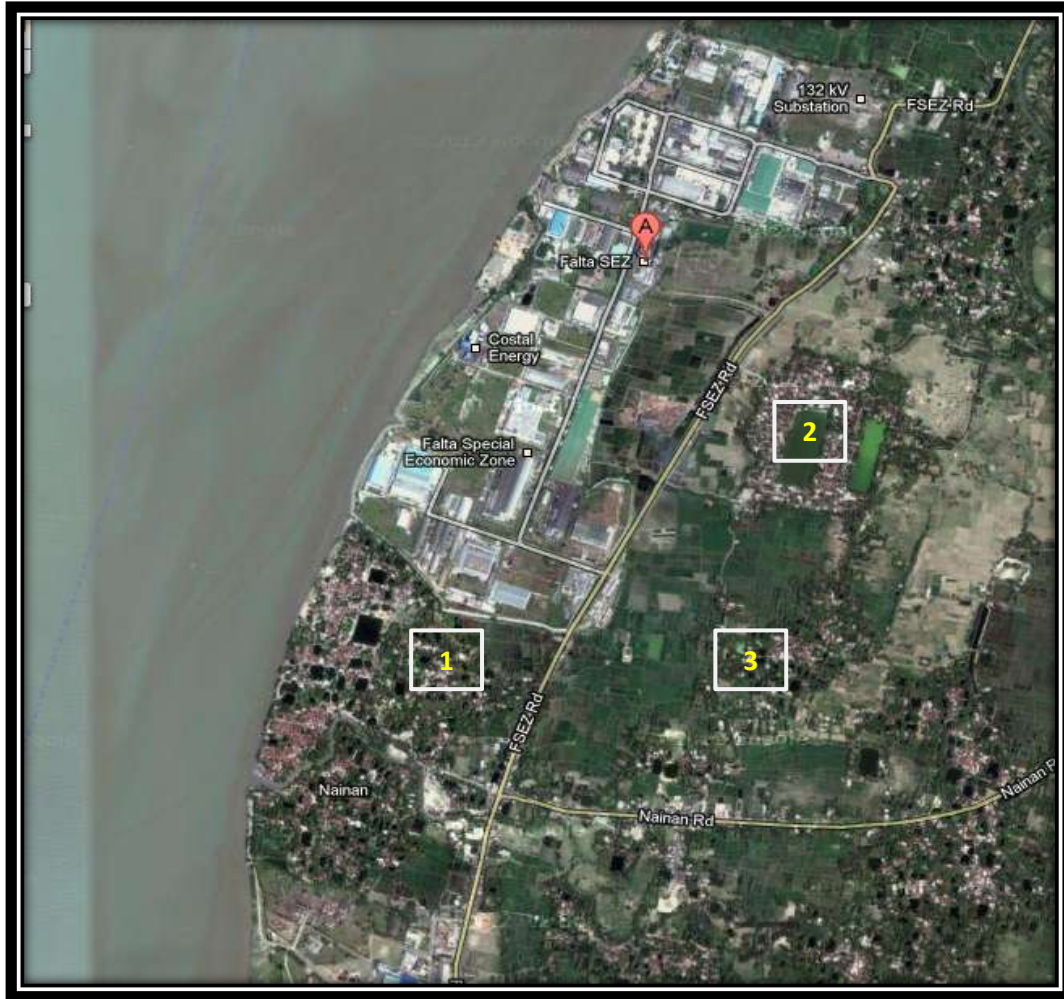
Figure 2.1: The villages studied in this paper.

Note: 1 – Nainan, 2 – New Gopalpur (“Higland”), 3 – Gopalpur.