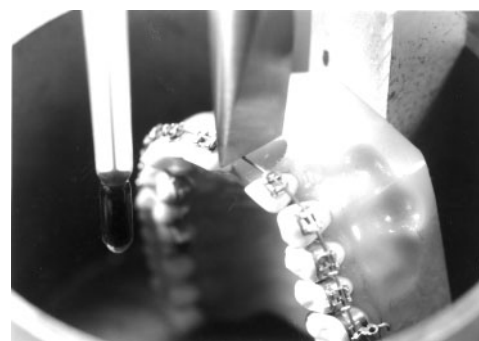
Figure 2 A test in progress on the phantom head jaw (without water).