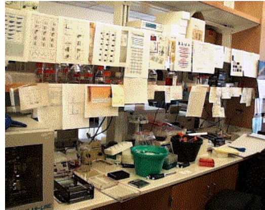
Figure 2. An experimental biology laboratory in which the Labscape project locates people, equipment, and a variety of experimental materials in order to automatically gather biological research data and anticipate biologist's experimental needs.

In order to meet its goal of discovering “languages and tools for biology that scientists will find indispensable for their own work, and that directly support communication