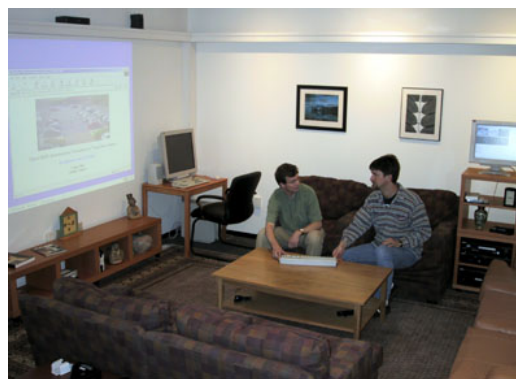
Figure 3. The EasyLiving system actuates behaviors in the environment dependent on the activities of occupants.

representation of this intention to complete an experiment.