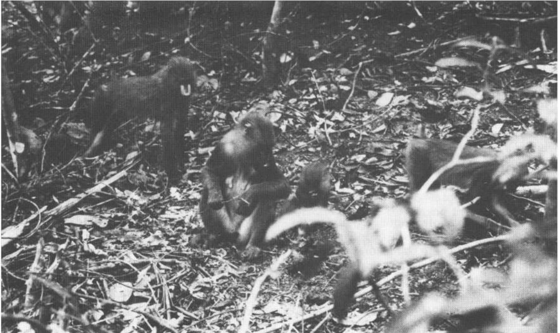
Part of a group of mandrills foraging for insects and roots on the forest floor. The female in the foreground is about to eat a root ( E. Rogers ).

range on a seasonally shifting basis, 1 month in 4–5 sq km suggests a range over 9 months of 36–45 sq km. Hoshino et al. (1984) estimated that the range of a group of 95 mandrills might reach 30 sq km in southern Cameroon. If mandrills use the forest more selectively, concentrating more time in particular areas, such estimates should be revised downwards.