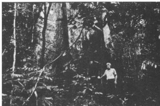
The base of a forest giant Ceiba pentandra in relatively open forest (Michael Harrison).

eat shallow roots and rhizomes. This shows a strong behavioural link with baboons ( Papio and Theropithecus ) elsewhere in Africa, who dig for roots and rhizomes in certain seasons. It also suggests an overlap with the niche of other forest-floor mammals such as bushpigs Potamochoerus porcus .