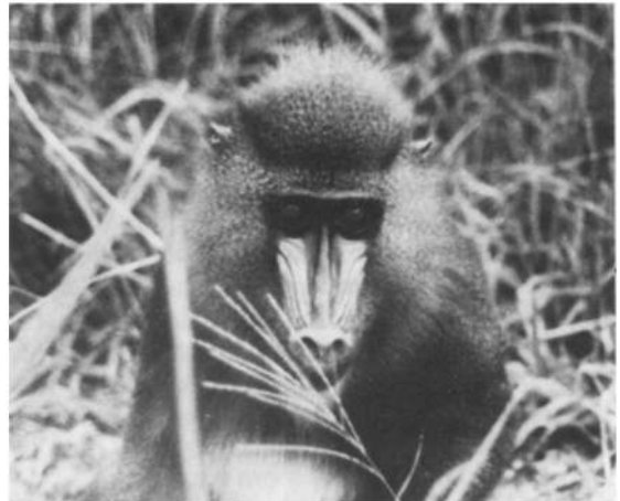
An adult female mandrill, showing the cheek ridges (Michael Harrison).

Some observations may illustrate this social flexibility. In the Lopé Reserve (March 1983), I followed for half the day a small silent group of 40 mandrills, amongst whom only one adult male was seen. This unit was feeding and moving independently of any large group. Hoshino et al. (1984) followed an independent unit of 15 mandrills for 5 days without meeting other mandrills. Such units were observed on several occasions to result from larger groups, splitting up, or to become part of larger groups forming as several subgroups joined. Even within large aggregations, subgroupings are persistent. For example, I observed a noisy group of over 150 mandrills in the Lopé Reserve (September 1983), in which a number of subgroups were spread over 500 m, moving in a swathe both on the ground and in fruiting trees. Each group formed a cohesive unit, maintaining contact with other units by a continuous chorus of two-phase contact barks, grunts, and ‘crowing’ calls. I counted one subgroup of 52 emerging from a single feeding tree. This subgroup contained four large males, of whom three were young and not fully mature, while only one was obviously fully mature, larger and full-bodied, his spectacular colouring well developed: electric blue ridged cheeks, vivid red