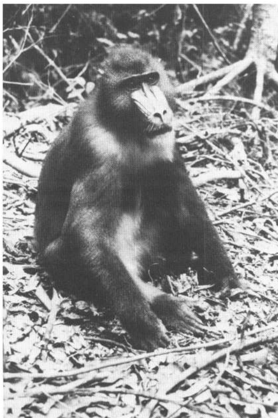
A sub-adult male mandrill (E. Rogers).

The earlier estimate of population density cannot be used to estimate the size of the mandrill population throughout the country. In order to extrapolate from the area of distribution, we need more accurate data on densities in different habitats with different degrees of disturbance from hunting, forestry or development. In areas that are inhabited by farming people and where forest has been depleted, mandrills are ex-