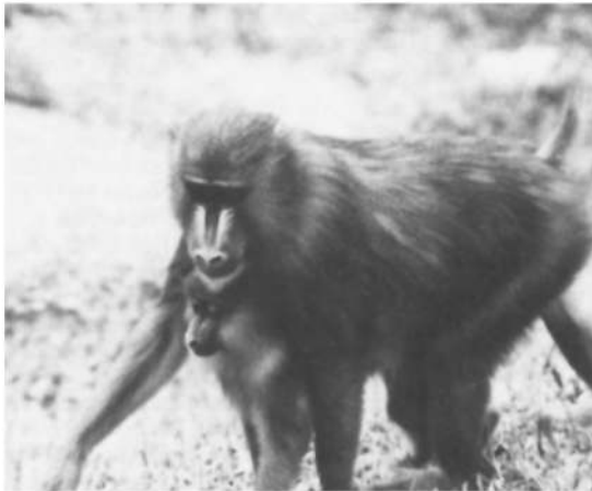
An adult female mandrill with an infant (Michael Harrison).

tremely rare or have been eliminated. Overall numbers have undoubtedly declined in recent years, not through an increase in human population, which is expanding slowly in Gabon, but due to the increasing availability of shotguns and transport, and accessibility to previously isolated areas of forest: compare Jouventin's observation rate of six or seven sightings of mandrills per month (1975), with my own 10 years later of less than one sighting per month, over a period of 15 months in the forest. This probably reflects a combination of factors, including reduced numbers, greater wariness towards people, and (given the wide-ranging habits of mandrills), reduced use of forest easily accessible by people.