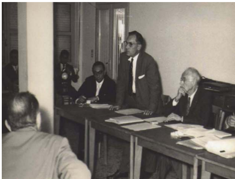
Figure 1 Ancel keys with Paul Dudley White and Flaminio Fidanza. Press conference in Gioia Tauro, Italy, 1960. Reproduced from: https://it.wikipedia.org/wiki/File:Ansel_Keys_-_Paul_Dudley_White_-_Flaminio_Fidanza_-_press_conference_in_Gioia_Tauro_-_1960.JPG .

The ancient Greeks paid special attention to nutrition, believing that a correct diet was a prerequisite for the physical and mental health. It was thought that several diseases depended on incorrect diets, so different nutritional approaches were used to treat various disorders. 9