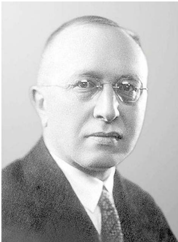
Figure 3 Nikolaj Anitschkow.

After many years of epidemiological and clinical studies, the importance of the diet on cardiovascular diseases