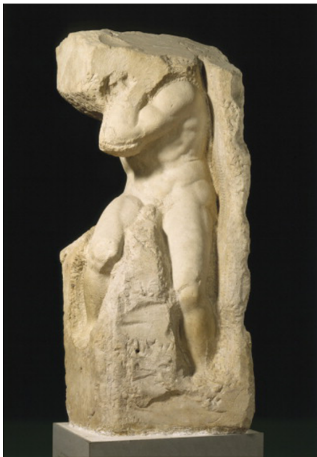
Fig. 1. Unfinished “captive” by Michelangelo Buonarroti.

Is such adaptation a good thing or a bad thing? The concept of partner affirmation describes whether the partner is an ally, neutral party, or foe in individual goal pursuits (Drigotas et al., 1999). As noted in Figure 2, affirmation has two components: Partner perceptual affirmation describes the extent to which a partner consciously or unconsciously perceives the target in ways that are compatible with the target’s ideal self. For example, John may deliberately consider the character of Mary’s ideal self, consciously developing benevolent interpretations of disparities between her actual self and ideal self. Alternatively, if John and Mary possess similar life goals or values, John may rather automatically perceive and display faith in Mary’s ideal goal pursuits.