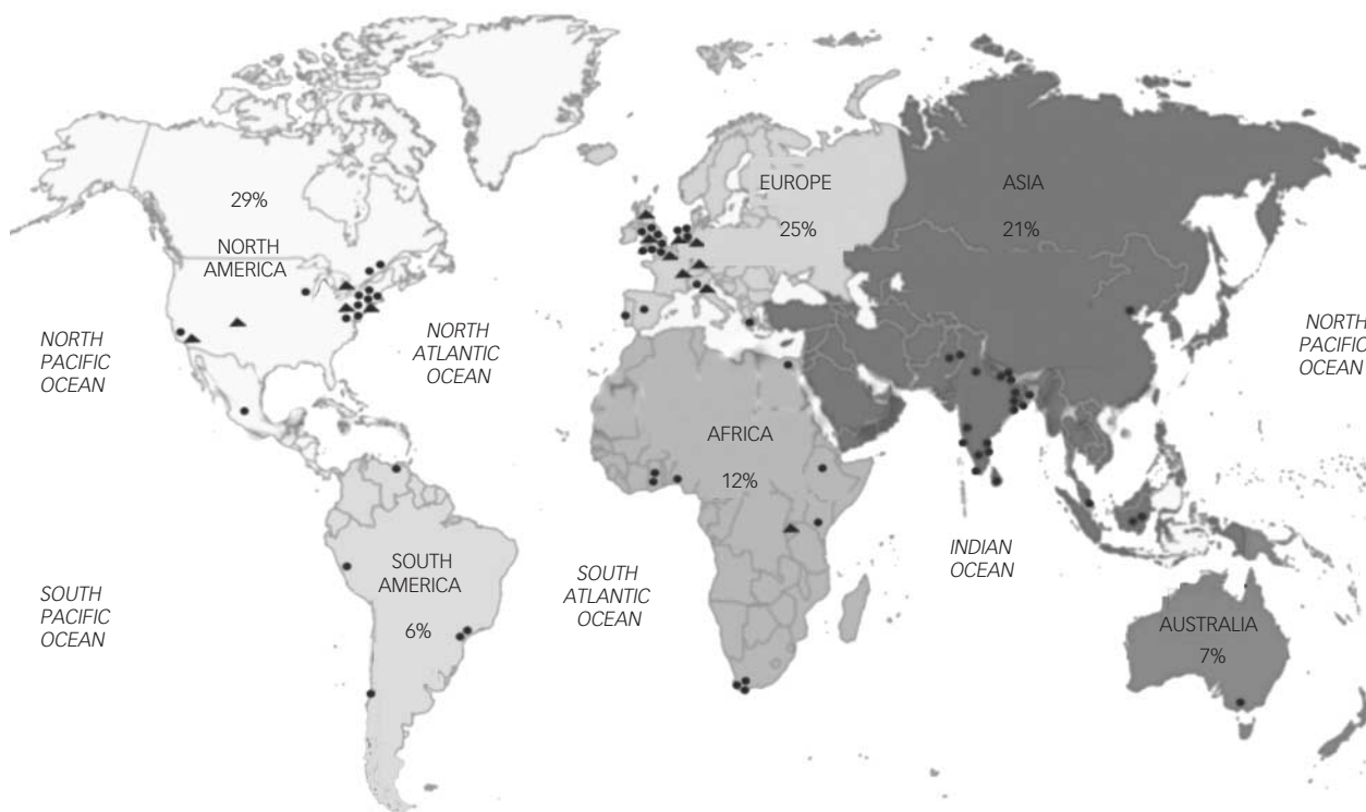
Fig. 2 Location of institutional members (n=77) and regional distribution of individual members (%) (n = 1304). Global organisations are shown as triangles and are located at either the corresponding address of the organisation or its current president. Circles represent institutional partners.

The Movement does not seek to duplicate or compete with the actions of its members; it seeks to build a coalition whose diverse members share a common goal and who can use the Movement to support their own activities and strengthen the Movement simultaneously. In all countries, people affected by mental disorders experience discrimination at multiple levels in society, 6 including within the healthcare system. Once affected by mental disorder, overcoming the layers of social barriers and discrimination is often a far greater challenge than overcoming the illness at the personal level. 6 In spite of international instruments aimed at protecting the rights of people with mental disorders, this community remains among the most vulnerable and neglected groups in all societies. 7 Against this backdrop, the struggle for social justice requires multiple actions, including an increase in availability of and access to a range of mental health services.