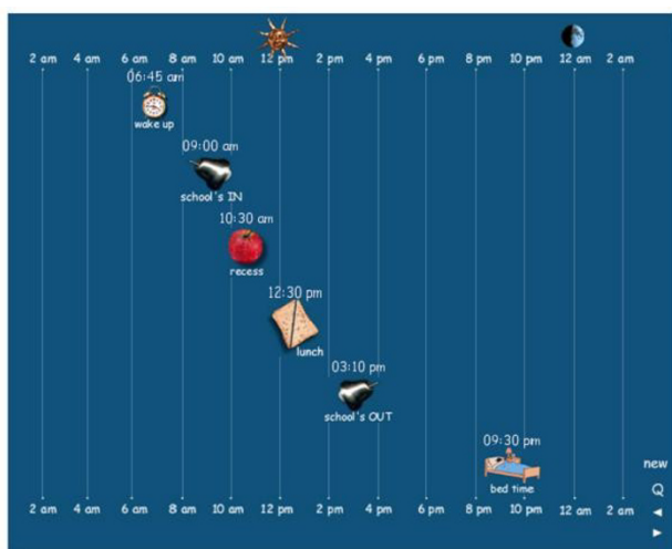
Figure 1 Example of a school day segmented according to school break times.

Some activities require a subjective intensity ranking. These activities are mostly physical activities such as locomotor activities, games and sports that can be performed at a wide range of intensities. In these cases, an intensity screen asks the user whether the activity was performed at light, medium or hard intensity. As children have difficulty understanding the concept of intensity [28], users are asked whether they need any help to decide. If so, a screen will appear that plays videos of children playing a ball game at varying intensities (see Additional File 1). Trost and colleagues [28] and Tremblay and colleagues [29] concur that videos are effective in helping children understand the concept of physical activity intensity. The videos used in the MARCA were initially developed for use in the Computer-delivered physical activity questionnaire (CDPAQ), a self-report questionnaire developed prior to the MARCA and a more thorough description of their development is available in Ridley et al. [20]. Once an activity has been selected, the name of activity, its identifying code, the start and end time, and duration of activity are recorded. Children continue to add activities to their activity list within each segment of the day, until the end of the day is reached.