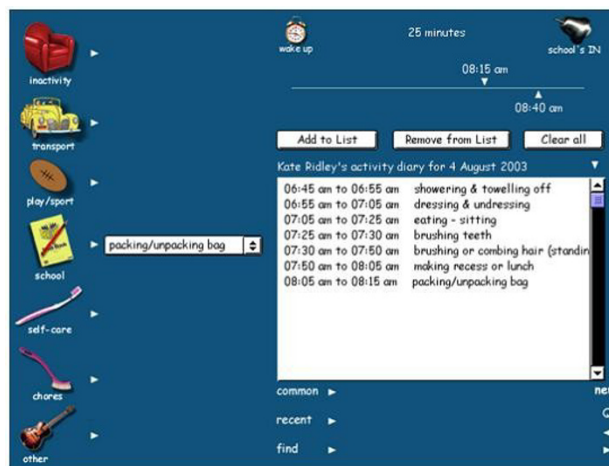
Figure 2 Example of one of the MARCA's segmented day screens.