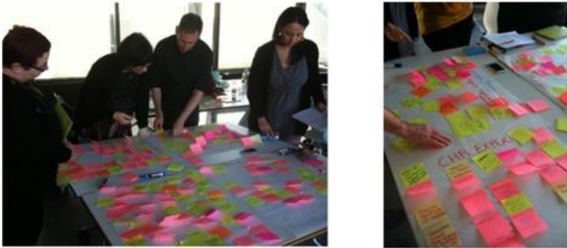
Fig. 1. Devising the MUSETECH model, meSch workshop, Museon, The Hague, February 2015

Following the second workshop, the MUSETECH model was developed in the form of the MUSETECH Wheel as seen in Figure 2. During discussion, “Technology” was seen as the element which permeates the “experience” of the three main entities but not as an entity of the same level or type of abstraction as the CHP, the Museum or the Visitor.