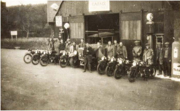
Figure 5. Control staff gathered at the garage at Montford Bridge, River Severn, near Shrewsbury (1932–37).

hysteria (articulated through militarized vocabulary borrowed from the First World War and the postwar “soft” invasion of American commerce and popular culture), numbers confronted were never remotely comparable to those of their continental European counterparts.