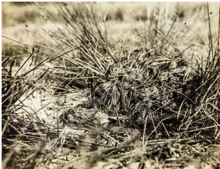
Figure 3. Trapped muskrat by lodge in the Severn catchment, near Shrewsbury (1932–37).

of three thousand animals, campaign manager Edric Druce insisted that complete elimination of Shropshire's erstwhile "hordes" was foreseeable within five to six years. Yet, by the time Bavarian experts replaced Vallings in late January 1933, the area of infestation in Shropshire and neighboring counties had apparently swollen to seven hundred square miles. 90