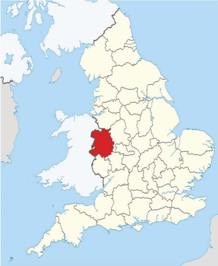
Figure 1. Map showing the location of Shropshire, which was at the center of the “Muskrat Menace.”

observed, it “enjoyed the dishonourable distinction of having a ‘Destructive Imported Animals Act’ passed all to itself.” 7 Muskrats could now only be kept under license and “subject to stringent conditions,” including a ban on their being held in “open colonies.” Prompted by an impending prosecution for non-compliance, the London College of Pestology’s director warned that, without enforcement, it would be the gray squirrel revisited, “but very much worse, for the musk rat . . . is vicious, destructive, and may be a serious carrier of disease.” So, whenever “met free he should be killed on sight.” 8 Such warnings notwithstanding, the new law failed to prevent further escapes.