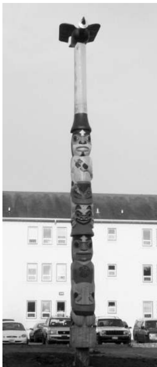
Figure 3. The Wellbriety Kootteeyaa totem pole stands on the SEARHC campus in Sitka, Alaska after its raising on October, 14, 2006.

with her own tradition and community in Alaska. In 2004 after a number of years as a Firestarter, she began an effort in Sitka that culminated in the raising of a traditional Tlingit totem pole called Wellbriety Kootteeyaa on October 14, 2006 (Wellbriety!, 2006). The project was generously sponsored by SEARHC, the Southeast Alaska Regional Health Consortium, a major provider of health services to the entire community in the Sitka region. The totem pole now rises proudly on the SEARHC campus for all to see. The Wellbriety Totem pole is a statement that recovery from alcohol and drugs, as well as healing from other diverse health problems is possible. It is a vivid symbol that the healing journey can be a partnership between the intertribal Wellbriety effort and a local or regional tradition.