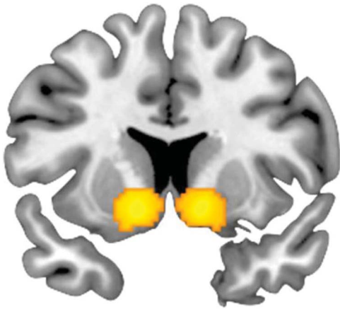
Figure 2. Coronal overlay on structural image illustrating reward-related VS reactivity. Bilateral VS reactivity to positive > negative feedback: right hemisphere maximal voxel MNI coordinates x = 12 , y = 10 , and z = -8 ; 376 voxels; t = 7.30 , p < .05 , FWE corrected; left hemisphere maximal voxel MNI coordinates x = -12 , y = 10 , and z = 10 ; 343 voxels; t = 6.18 , p < .05 , FWE corrected. Displayed at y = 10 .

antisocial facet was positively associated with left VS reactivity. 1