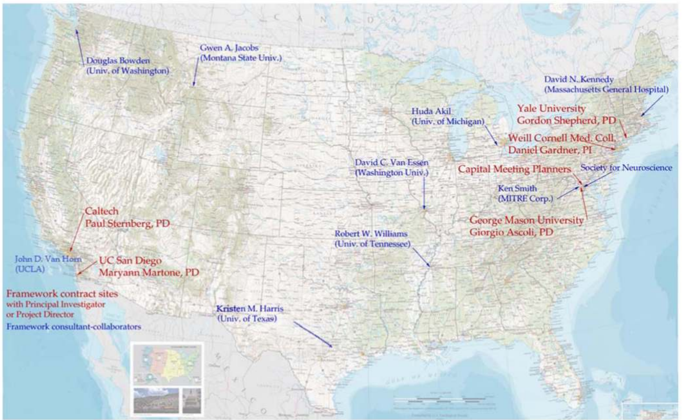
Fig. 1. Framework contributors include both contract sites and volunteer consultant-collaborators. An Appendix lists contributors in greater detail