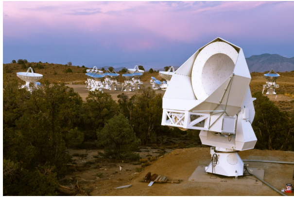
Figure 1: Picture of the POLARBEAR experiment with the Huan Tran Telescope, as of February, 2010, at the Carma site, California.

We describe the Cosmic Microwave Background (CMB) polarization experiment called POLARBEAR. This experiment will use the dedicated Huan Tran Telescope equipped with a powerful 1,200-bolometer array receiver to map the CMB polarization with unprecedented accuracy. We summarize the experiment, its goals, and current status.