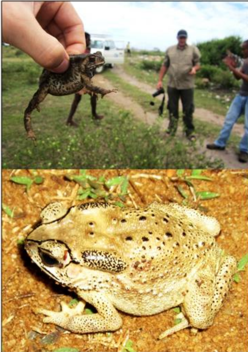
Fig. 1. The Asian toad in Toamasina showing its distinct appearance and size which is unique and unlike any other amphibian species in Madagascar.

A second series of social surveys were conducted from 8-16 October 2014 by eight ISSEDD students divided into four teams. The methodology was the same as the earlier surveys, except that geographic coordinates were recorded using a Garmin GPSMap 60CSx GPS unit, the surveyors omitted question #3, and multiple residents were interviewed per site.