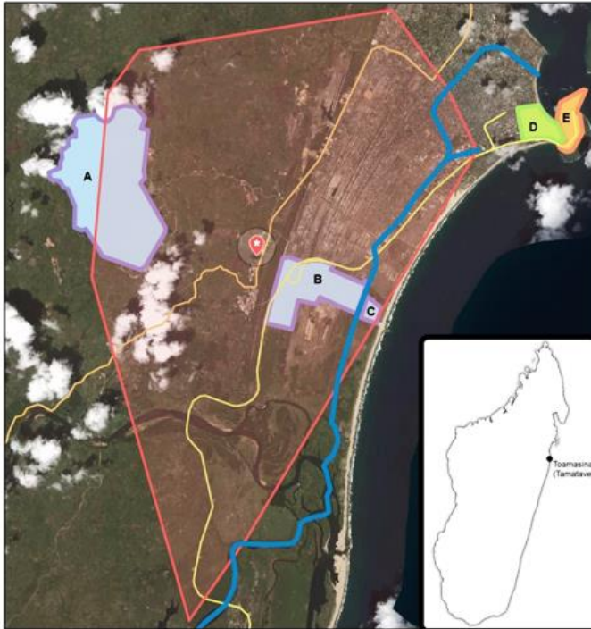
Fig. 3. Map of the distribution of the toad showing key features around Toamasina. A) Ambatovy tailings. B) Ambatovy plant. C) Ambatovy residential camp. D) city center. E) port. The starred flag corresponds to the centroid of the polygon and possible vicinity of introduction. The orange line is National Route 2 and National Route 5 and the yellow line is the railroad. The blue line is the Canal de Pangalanes. Map created using Mapbox ( www.mapbox.com )