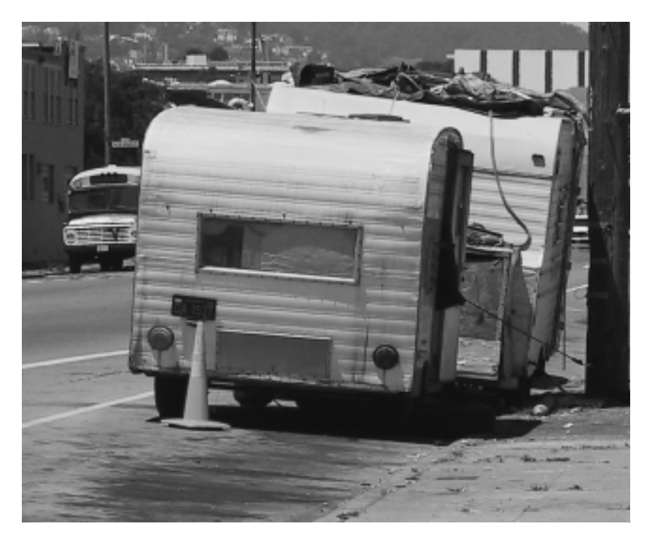
Figure 2 Van living on 16th Street, San Francisco.

suffer from an acute shortage of shelter beds, with the biggest shelters running lotteries to assign scarce sleeping space.