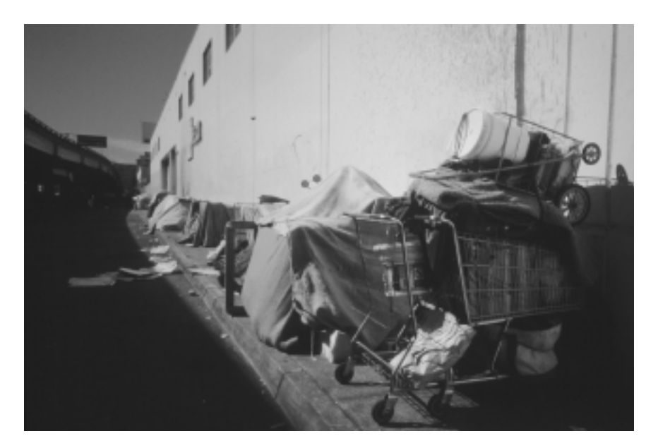
Figure 1 Homeless encampments, Division Street, San Francisco.

has trapped and concentrated the local poor population, swelling the city's African-American population to a majority. Many, perhaps most, St Louisans aspire to join the persistent exodus leaving the city's rotting core for the surrounding suburbs of 'the County'. The cost of housing in St Louis is much lower than in San Francisco, with equivalent apartments going for a third to one-half of San Francisco prices; yet at the bottom of the housing market there is a similar shortage of very cheap housing, a shortage which in fact extends across the entire country. Rather than making up the shortfall of affordable housing, the federal government has steadily decreased its role in housing provision, consistent with the broad reduction of federal aid to the cities since 1980 (Katz, 1989: 189–90).