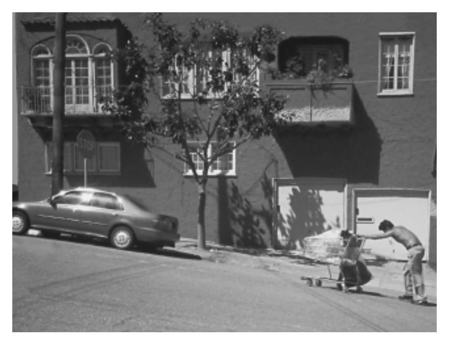
Figure 3 Looking for recyclables in Potrero Hill, San Francisco.

categories of 'homeless man' and 'ex-con' overlapped so much that they became more like two viewpoints on the same population than discrete groups of people or conditions. The road to the street almost always included stretches of prison or jail time; only one of the St Louis men started the cycle with homelessness. <sup>12</sup> The San Francisco population was more diverse, with more men initially entering the cycle through homelessness. As rabble management was so much more intense and the level of criminal activity lower, sentences were shorter and charges less serious. Yet in both cases, once the cycle was initiated, men were carried along in its momentum. Regardless of how they had entered the nexus, they continued to tumble from incarceration to homelessness, homelessness to incarceration.