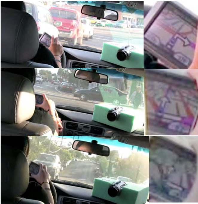
Figure 1: A turn with GPS.

Along with the video data we also drew on an auto-ethnographic component - the authors travelled on ten journeys taking part as both passenger or driver, making use of GPS. At the end of each journey the authors wrote field notes documenting their use of GPS, and any problems that arose. This data was particularly valuable when combined with the video data, supporting the understanding of particular incidents and issues through reflection on the authors own experiences.