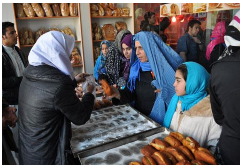
Figure S3. The new bakery has become a popular place to buy bread, cakes, and sweets.