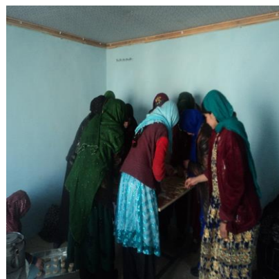
Figure S2. Women learn to operate the new baking equipment.