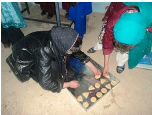
Figure S1. Women prepare a tray of cookies for baking.