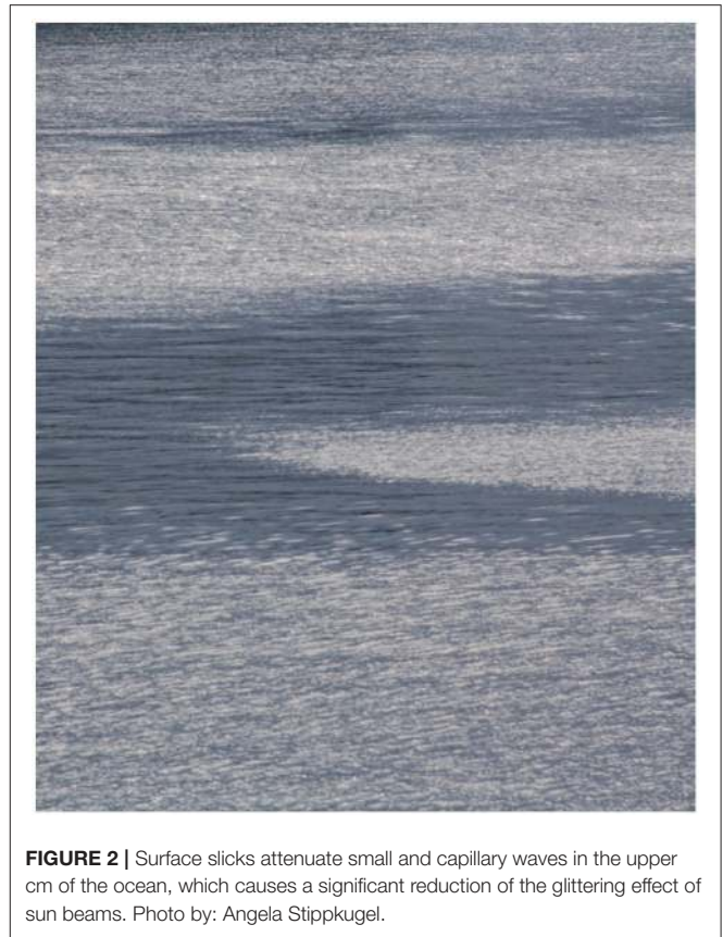
FIGURE 2 | Surface slicks attenuate small and capillary waves in the upper cm of the ocean, which causes a significant reduction of the glittering effect of sun beams.

Very strong accumulation of organic matter in the SML can lead to the formation of surface slicks, which can be distinguished from non-slick surfaces by their different reflectance properties that result from increased wave damping (Figure 2). Slicks are frequently observed in the oceans, but it remains unclear whether they are specific cases of surfactant enrichment or whether they should be regarded as an exaggerated SML including chemical and biological constituents. It has recently been proposed that the accumulation of organic gels in the SML may directly suppress gas exchange by virtue of their inherently high surface to volume ratio, acting as a diffusional barrier (Engel and Galgani, 2016;