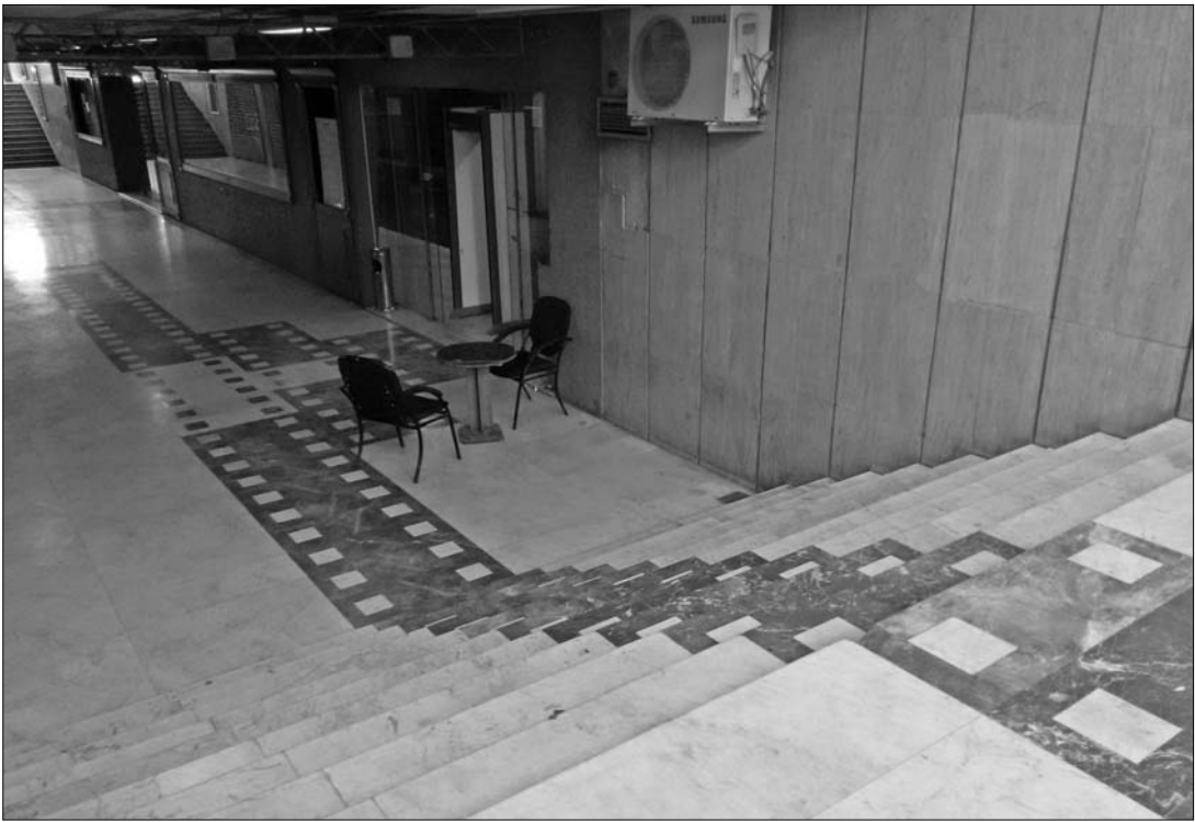
Stairs leading down to the Al-Hamra theatre.

were arrested. 15 While the names of ministers and directors remained the same, theatre houses were the last choice for social gathering. Distrust of theatre institutions became the norm, and the Opera House remained unfinished, waiting for a special strategy to make it run.