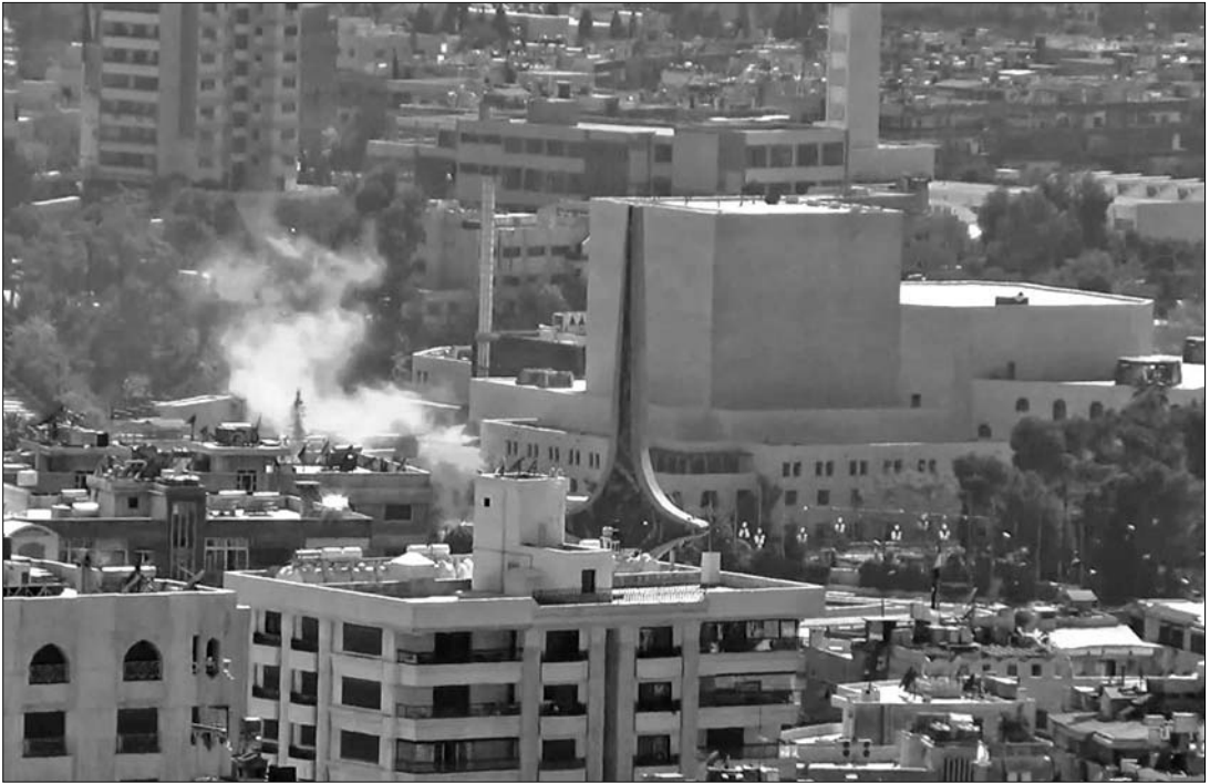
Mortars hitting the Opera House in Damascus in 2013.

archy. It also enjoys an 'exceptional economic system' that allows it to obtain an annual budget acquired directly from the Ministry of Treasury. The Opera House keeps the income from its performances as a supplement to its annual budget, enabling it to extend some of its activities.