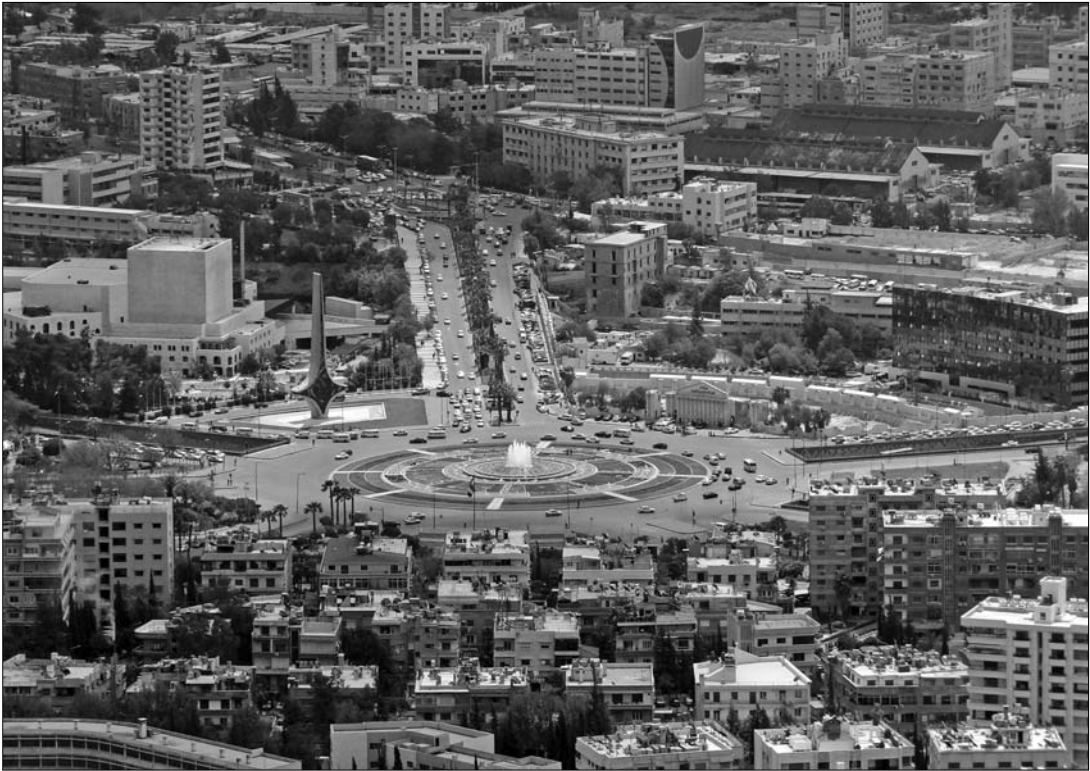
The Opera House in Damascus and Omayyad Square.

of the bombing of Rafiq Al-Hariri's procession in 2004. The regional challenges were accompanied by the slow pace of introducing Syria to the world of mobile phones, internet, banks, and KFC. The new president achieved two images: he was the victor regionally, and the modernizer locally.