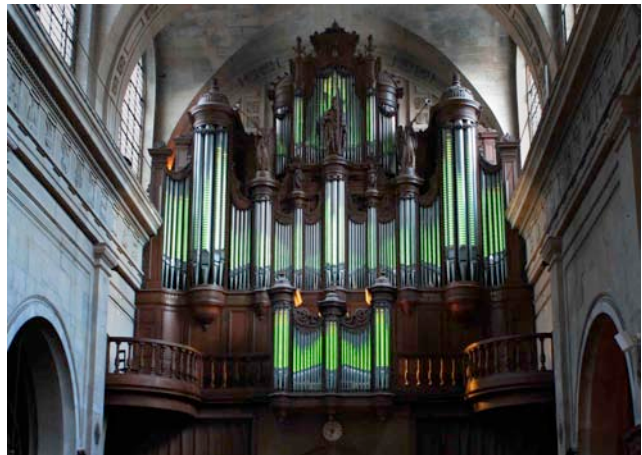
Figure 1. Snapshot of the visual animation during an ORA concert; the instrument’s façade is lively animated by the played music.

listeners. It is well known in organ music interpretation and composition that the organist plays with the organ and the corresponding room acoustic response in a unique way. This inner / outer sound dialogue is envisaged from a technical and musical point of view in Section 3.