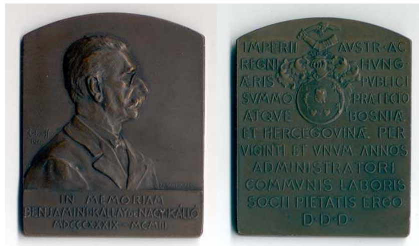
Figure 6. The Benjamin Kállay de Nagy-Kálló 1903 plaque (obverse and reverse) (Zagreb Archaeological Museum Numismatic Collection)