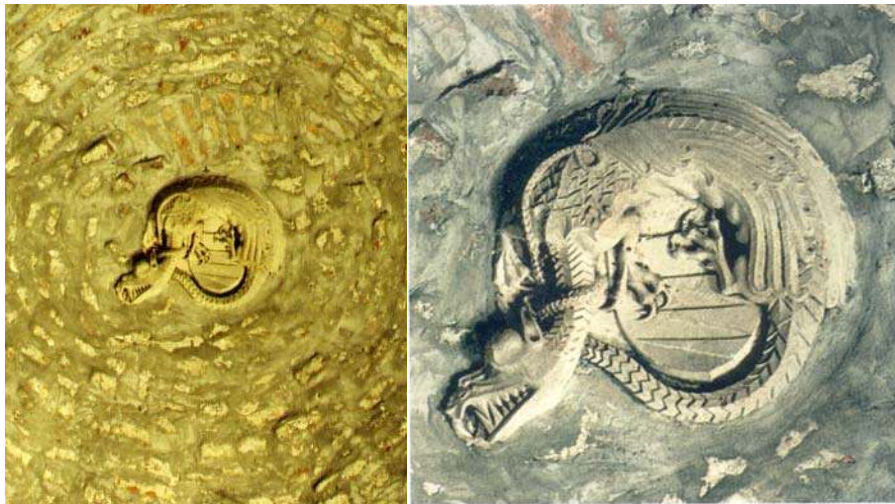
Figure 7 (left). The Morović coat-of-arms, Valpovo, Croatia