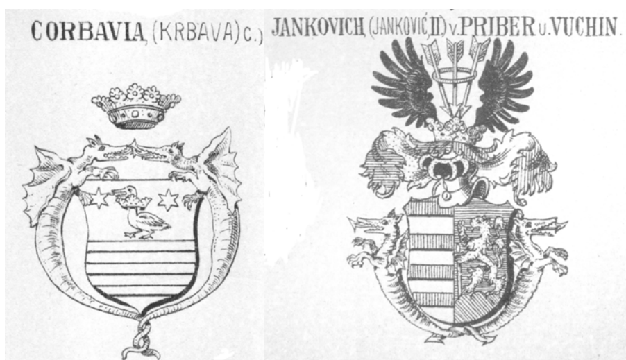
Figure 12 (left). The Corbavia (Krbava, counts) coat-of-arms (BOJNIČIĆ 1899: 39, Pl. 30)