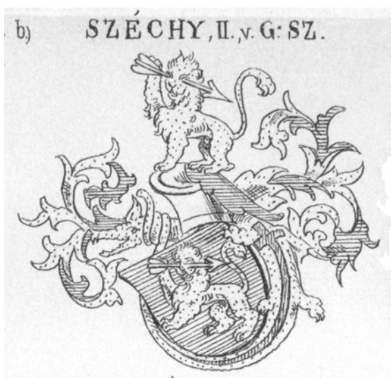
Figure 11. The Széchy coat-of-arms 1418 (CSERGHEŐ IV, 1891/1892: 619-620, Pl. 419)

the enframed inscription below it: VIRTVS. STATILIOR/ ME. SIBI. VENDICAVIT./ .M.D.XVI. (FISKOVIĆ 1962: 100, Fig.14; CICARELLI 1964: 100, fig. 1; BABIĆ 1996: 135), the whole relief within an astragal border, resting on three consoles (Figure 10). The Statilio tower was therefore constructed upon the order of John Statilio or his nephews. It was in poor condition until 1958 when the Institute of Preservation of Cultural Heritage for Dalmatia had it restored (CICARELLI 1964). Unfortunately, since then, it has been closely surrounded by houses.