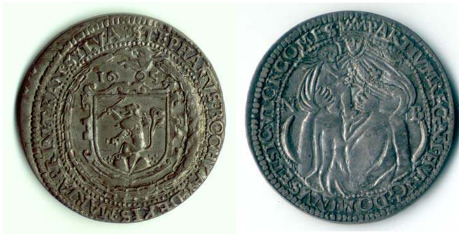
Figure 3. Arms of Stephen Bocskai of Transylvania on taler dated 1605, with dragon surrounding shield (Zagreb Archaeological Museum Numismatic Collection)

In Hungarian, Transylvanian, as well as Croatian armoury there are more than thirty families boasting the Order of the Dragon listed in Appendix 2. (Figures 3, 4, 5, 6, 7, 8, 9, 10, 11)