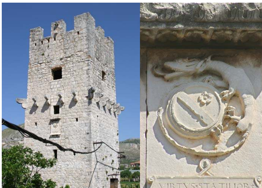
Figure 9 (left). Seget nr. Trogir, Croatia, the Statileo Tower