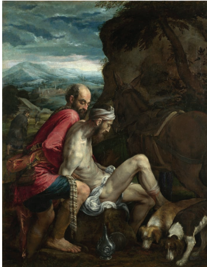
Fig. 1. In the parable of The Good Samaritan [painting by Jacopo Bassano, d. 1592, copyright 2006, The National Gallery, London], Christ preaches universal compassion and prosocial behavior. A similar message is found in many religions. Modern research from social psychology, experimental economics, and anthropology suggests, however, that religious prosociality is extended discriminately and only under specific conditions.

In several behavioral studies, researchers failed to find any reliable association between religiosity and prosocial tendencies. In the classic “Good Samaritan” experiment (22), for example, researchers staged an anonymous situation modeled