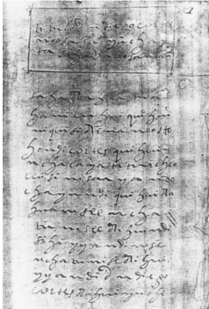
Figure 5. Page from Mixtec title.

time of the conquest. In form and style, the pictorial portion of the Mixtec title reveals a conscious attempt to imitate earlier writing. For example, the map portrays couples in profile, who face one another, reminiscent of ruling couples in preconquest-style codices and sixteenth-century pictorial writings (see Figure 6). Here, the couples appear before churches, just