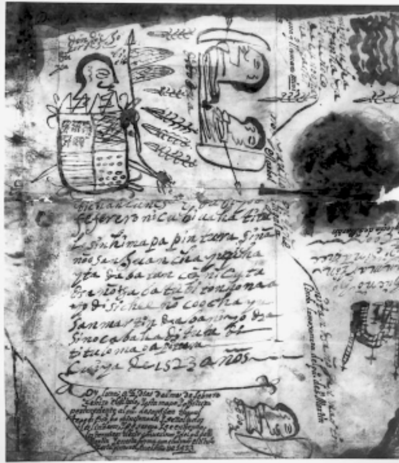
Figure 4. Detail of map showing Don Diego Cortés Dzahui Yuchi.

based on the ancient calendrical naming system, or it may be a personal name. 20 Preconquest-style codices show that lords possessed both calendrical names, based on their dates of birth, and personal names. As in the Nahuatl title, don Diego's story attempts to portray an early-colonial consensus among the Mixtecs and Spaniards. The Nahuas are conspicuously absent, undermining Mexicapan's claim that they rescued the Zapotecs from the Mixtecs. On the contrary, the Nahuas appear as uninvited meddlers who disturbed a peaceful situation.