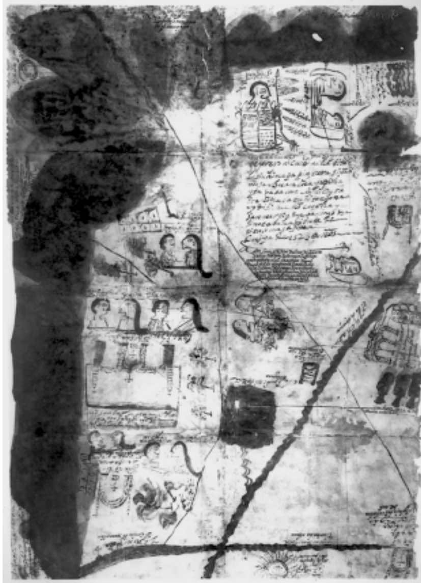
Figure 3. Mixtec “pintura y mapa.”