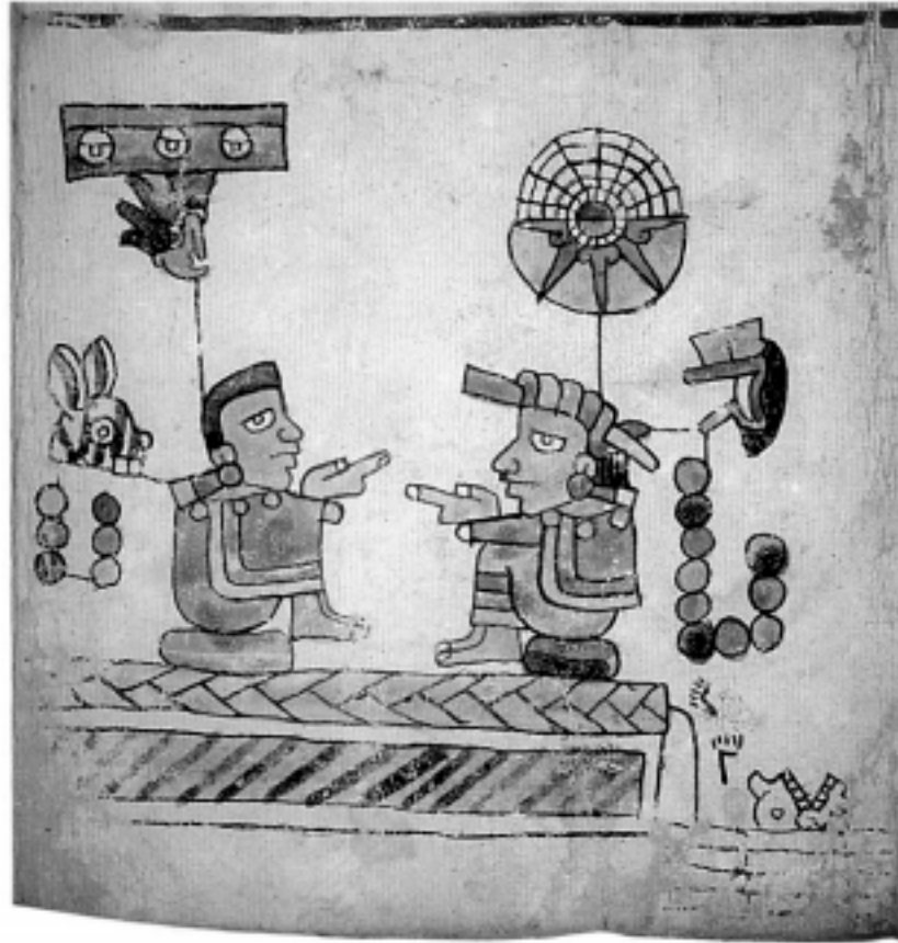
Figure 7. Depiction of Mixtec yuhuitayu in Codex Becker II.

of reeds.” 38 Reeds refer to time as well as place. The reed was both a day sign and one of the four year bearer signs in the Nahua and Mixtec calendars. Nahua writers used bundles of reeds to signal the binding of years at the close of a cycle. 39 Floods also symbolized the passage of time. In Mesoamerican lore, floods marked the end or beginning of a cycle, including the cosmological end of the fourth sun. The title’s references to reeds and floods associate the foundation of the altepetl and the legendary defeat of the Spaniards with the beginning of a new cycle. One can imagine how the migration and military victories would have been depicted in a pictorial manuscript, crowned by the foundation of the altepetl of Acatepetl. As