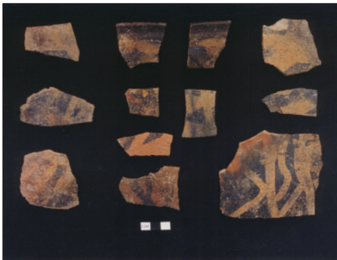
Figure 2. Painted black-and-red ware sherds, from early iron bearing deposits of Period II, Raja Nala-ka-tila, Dist. Sonbhadra.

Since the date for the introduction of iron in the middle and lower Ganga Valley was