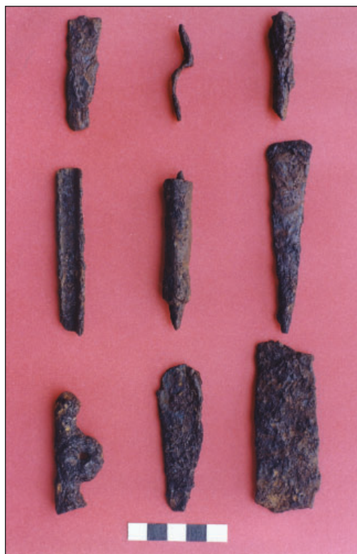
Figure 3. Iron artefacts, from the lower and middle levels of Period II, Raja Nala-ka-tila, Dist. Sonbhadra.