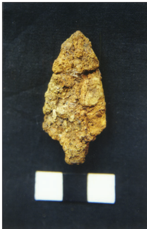
Figure 7. Highly corroded iron arrowhead, Period I, Dadupur, Dist. Lucknow.