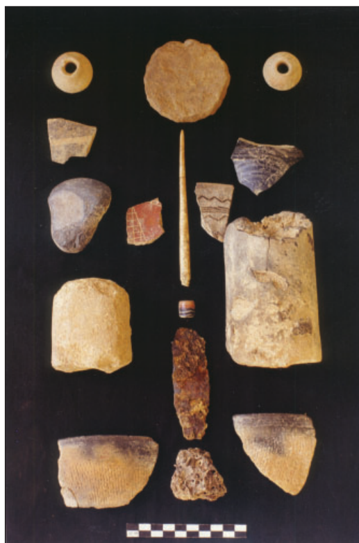
Figure 5. Important cultural components of the early iron bearing deposits, showing corded ware sherds, iron artefact, slag, tuyere, stone and bone artefacts, painted and incised potsherds, stone and terracotta beads. Period II, Malhar, Dist. Chandauli.