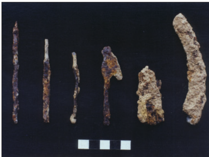
Figure 4. Iron artefacts, from the lower and middle levels of Period II, Malhar, Dist. Chandauli.

The area around Malhar may have been something of a centre of iron production. A small mound, of a kind known locally as lohsan or lohsanwa , about 500m south to the main site of Malhar, which looks like a heap of iron slag, on excavation revealed two damaged clay furnaces, one of them is illustrated here as Figure 6, filled with iron slag along with a few sherds of the red, grey, and black slipped wares, an axe, and tuyeres . Survey revealed several lohsanwa sites near Musakhand village, the site known as Phakkada Baba located within the Musakhand dam, to the north-west of Malhar, on Baba Wali Pahari (Tewari et al. 2000) and near Naugarh kot (Singh et al. 2000: 143). Plans of damaged clay furnaces within heaps of iron slag along with tuyeres stuck with smelted iron, and potsherds of the grey, black slipped, NBP and red wares were found at these sites. The pottery assemblage at Phakkada Baba also included examples of dish or bowl-on-stand and other forms, comparable to those from Malhar Period II, in red ware, and black-and-red ware. This extraordinary concentration of iron-slag heaps on Baba Wali Pahari and Naugarh kot suggest that large-scale iron smelting activities continued at these sites for a long time.