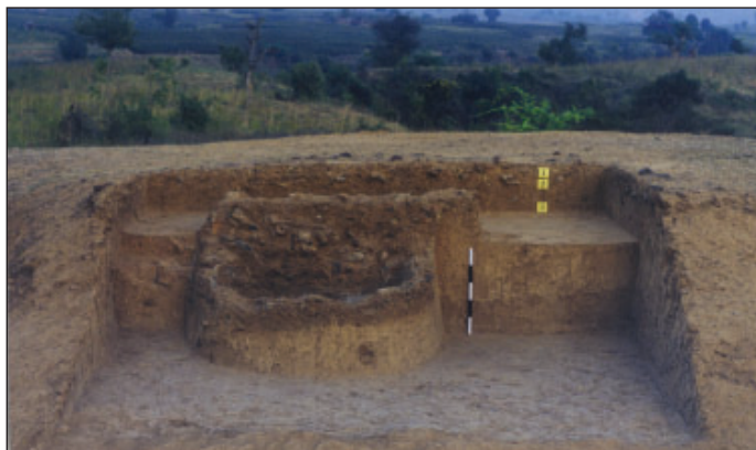
Figure 6. Damaged circular clay furnace, comprising iron slag and tuyeres and other waste materials stuck with its body, exposed at lobsanwa mound, Period II, Malhar, Dist. Chandauli.

shown in Figure 7. Red ware dominates the pottery assemblage of this period, while the