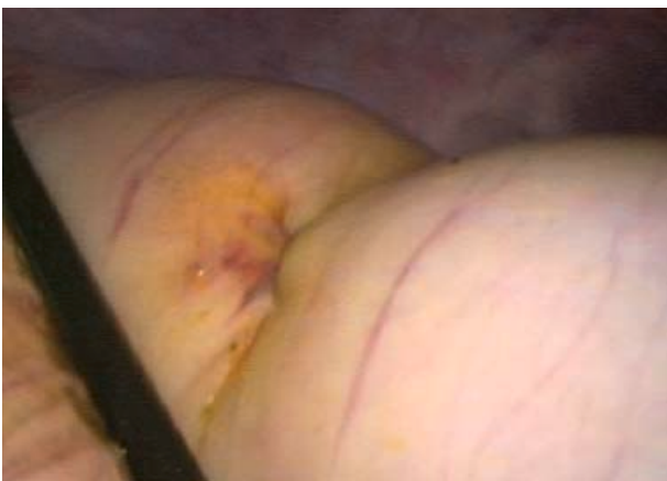
Figure 6. Laparoscopic view of the clipping site after intraluminal closure of a gastrostomy. Note the impression at the gastric surface, indicating the involvement of the muscular wall into the tissue capture by the clip.

The technique described here allowed closing gastric and colonic access perforations in the porcine