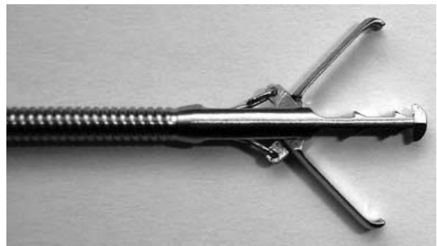
Figure 3. Twin grasper for the approximation of perforation holes in NOTES.

For closing gastric or colonic access holes different techniques can be used to approximate the wound margins before the OTSC is released. These can include larger endoscopic graspers or suction of the tissue into the applicator cap. A novel twin grasper (Figure 3) can be used to facilitate the approximation of the tissue in NOTES (Ovesco Endoscopy GmbH, Tuebingen, Germany). This grasper has one fixed middle branch and two independently