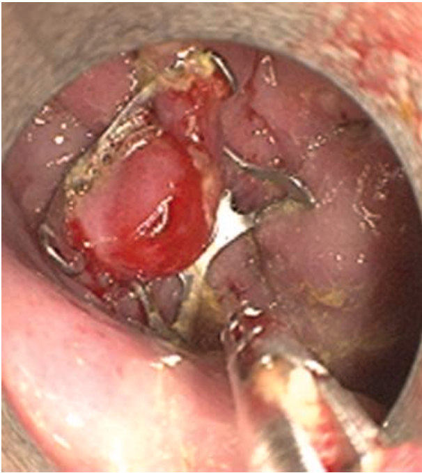
Figure 5. Gastrostomy closed by OTSC.

success (9). This was the reason to study a technique for the application of OTSC also in the field of NOTES access closure. The OTSC clip has been successfully used clinically in different areas of conventional flexible endoscopy (10). Healing of the gastric wall after closure has not been examined in our experiments. Clinical experience, collected with OTSC for gastric closure on a case level outside of NOTES applications, however, has shown promising results (11).