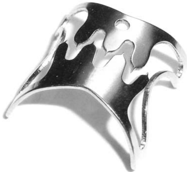
Figure 1. OTSC, Over-The-Scope-Clip.

The OTSC (Figure 1) is made of Nitinol and can approximate wound margins like a surgical clamp. It is preloaded in bent shape on its application device