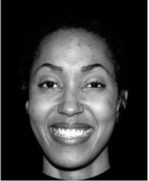
Figure 2. Stimuli used in Experiment 3.