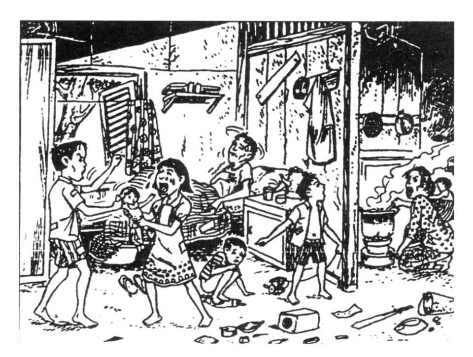
Figure 4. "A poor hetero family that does not follow Family Planning. In the end they create not heaven but a 'hell' on earth. How far can this husband and wife guarantee that their children will become successful people later on?"