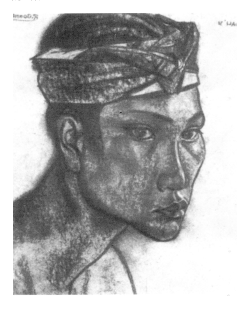
Figure 3. Portrait of a Young Man (1931), by R. Bonnet. Pastel.

determined to be reduced to an aggregate aftereffect of localization. Indonesians do not identify as gay, then imagine themselves as part of a national community, then construct it as part of a transnational community. The process proceeds on all levels at once, in a historically specific manner, sometimes through the explicit metaphor of a gay archipelago. Postcolonial lesbians and gay men are not "the same" as "Western" lesbians and gay men, and they do not live across a chasm of absolute difference.