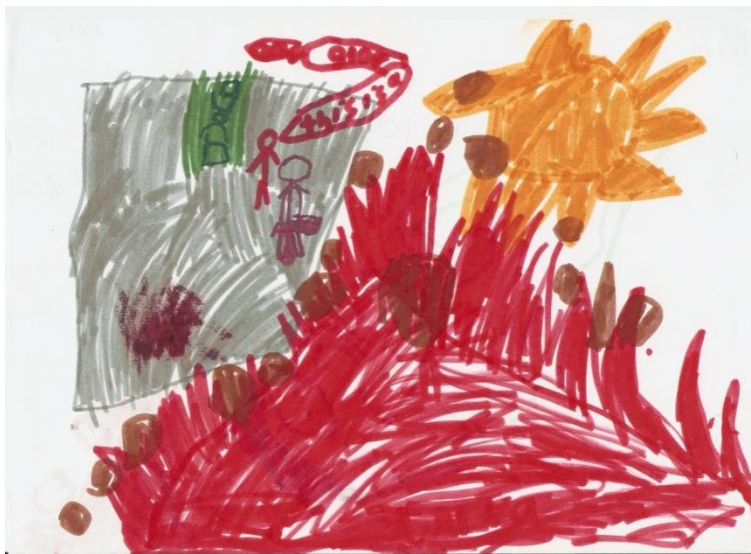
Figure 2: Henry's drawing

However, the following example (see figure 2) from Henry reveals his approach to object-friends which, far from deficient, could be seen as highly strategic. Seen through a psychological lens, we could read this as a lack of confidence in making friends but, if we consider it from an embodiment perspective, we can see the benefit of an object-friend for coping with the unpredictability of classroom social life.