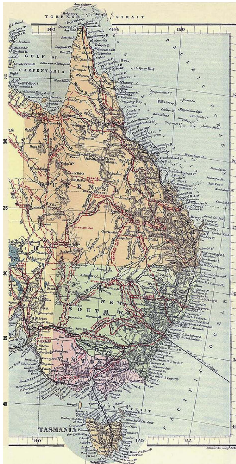
Figure 3 Part 3 - Map of Nineteenth Century European exploration of Australia (with permission) [71].