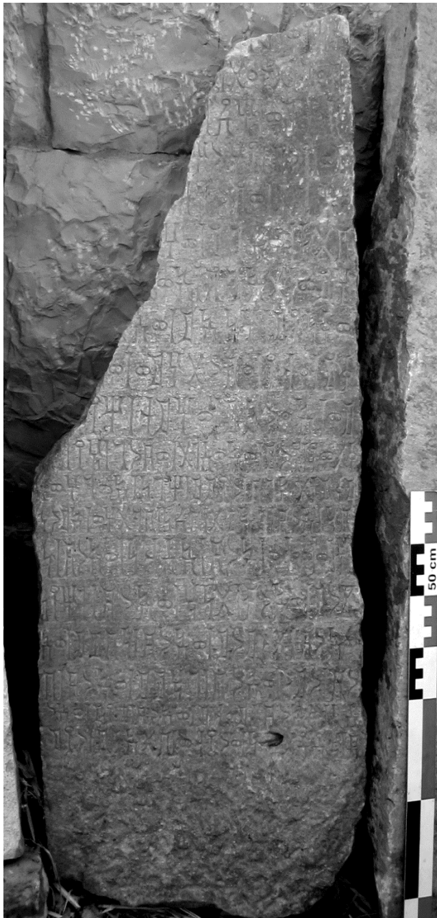
Figure 2: Inscription Jabal Riyām 2006-17.

The unknown authors of the text give thanks to Ta'lab Riyām, the main deity of the tribes of Ḥāshid and Ḥumlān in his sanctuary on the Jabal Riyām, in order to gain the favour of their lords of the lineage of Bata' as well as fruitful crops and harvests. They follow the common format of a dedication usually made to this deity.