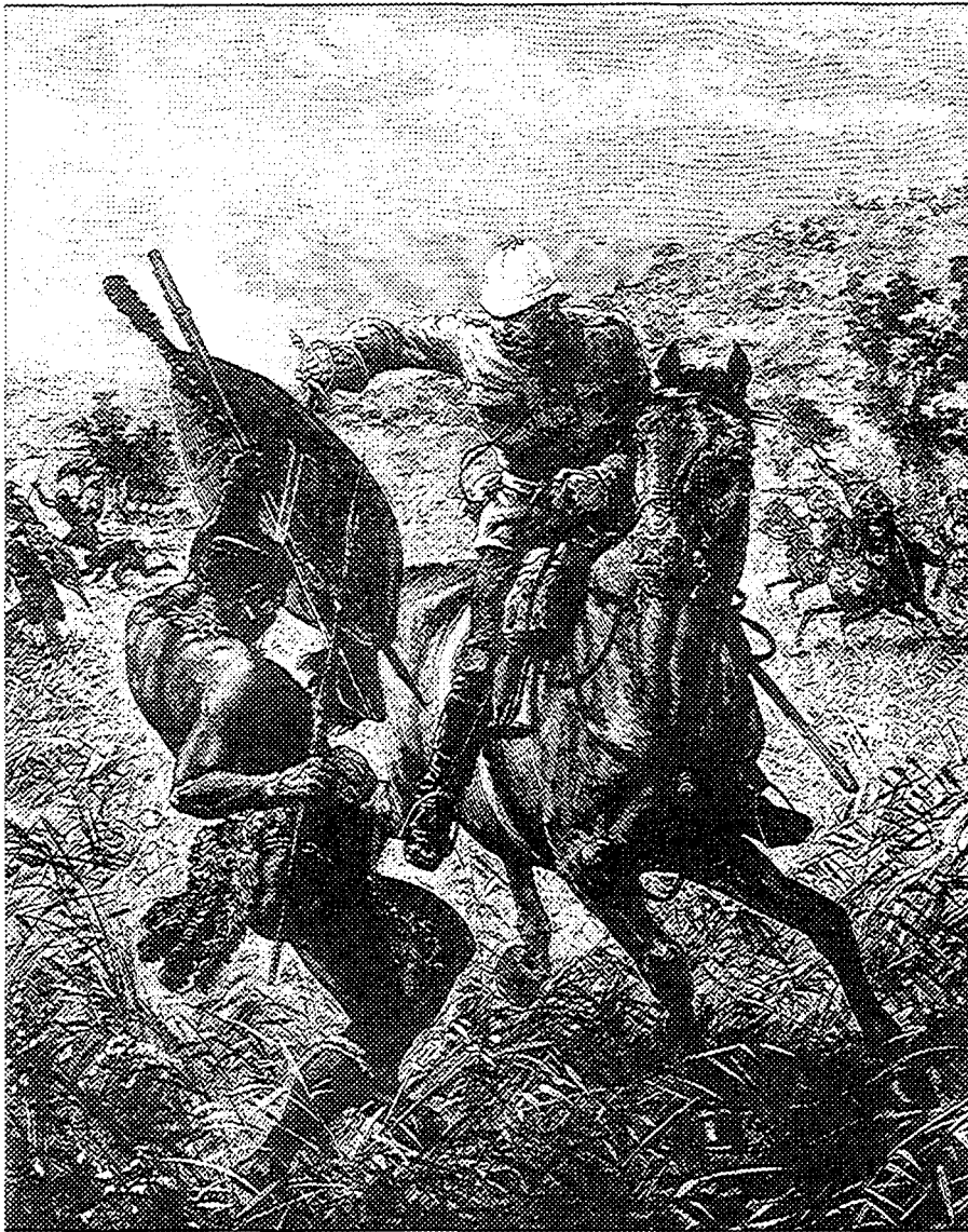
Fig. 2 Lord Beresford's Encounter with a Zulu. Cover of the Illustrated London News Vol. LXXV, no. 2099. Saturday, 6 September 1879.

What jolted the viewer out of this mood, however, was the fact that, visible from the entrance, was an enormous, wall-sized enlargement of an image of a mounted British soldier thrusting his sword into the breast of an African warrior (Fig. 2). This was labelled (none too readably) “Lord Beresford’s Encounter with a Zulu.” The text posted nearby identified this