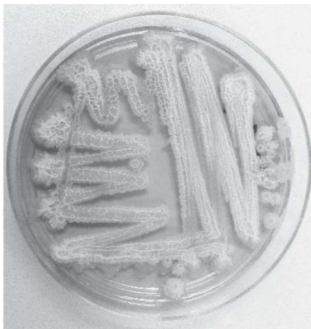
Fig. 2 : Bioflocculant-producing bacteria with highly mucoid and ropy colony

Flocculation activity : Flocculation activity ranged between 68% and 93% (Fig. 3), with the highest activity coming from B. infantis .