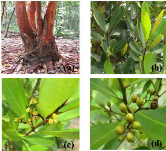
Figure 2. Key species ( Tristaniopsis merguensis ). a) stem; b) leaf; c) flower; and d) fruit

Composition diversity of various plant species is the carrying capacity of suitable habitat for various species of animals, such as vertebrates. The composition of this biodiversity can lead to the mutualistic relation in the interaction in the habitat. The results of data processing supported by the secondary data show that various species of vertebrate inhabit Biodiversity Park of Pelawan Forest; they are 3 families of amphibians (6 species), 8 families of reptiles (16 species), 35 families of birds (99 species), and 8 families of mammals (14 species), as shown in Table 3.