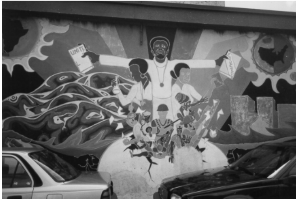
Dana Chandler, Knowledge is Power: Stay in School (Detail) , 1972

In essence, the lack of artist organization made the community-based murals vulnerable to being co-opted and controlled by municipalities.