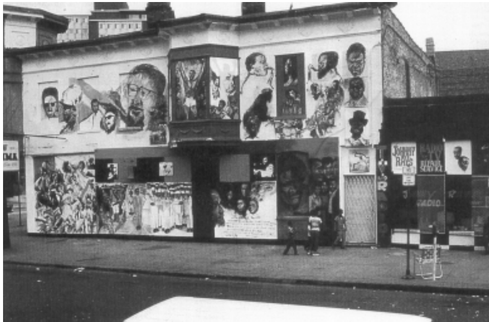
William Walker, et. al., The Wall of Respect , Chicago, 1967

African American artist William Walker was one of the first painters to depict black culture in large-scale color, and in public, at a racially dangerous time. He painted a portion of the original 1967 Wall of Respect in Chicago. Largely regarded as the first community-based mural, this wall was a collaborative effort of about sixteen African American artists.