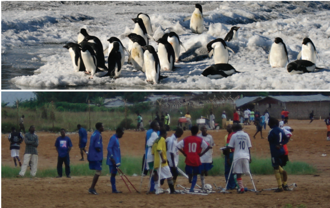
Figure 2. Above: Spheniscus demersus or blackfooted penguin in Antarctica. Below: Homo sapiens , or humans in Africa. Both groups have a statistically similar chance of interacting with a Psychiatrist. Note that the penguins all have legs.

physical therapy—reach only 1–2% of persons with disability [16]. It is fruitful to explore potential reasons for this mismatch in Africa.