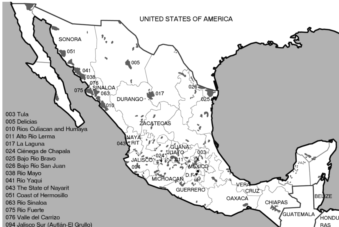
Map 1. Irrigation districts in Mexico.

Another important policy experiment – in the El Grullo irrigation district in the western state of Jalisco – strongly contributed to the assemblage of the transfer policy. Farmer involvement was not new in El Grullo, as a team of middle-level SARH engineers had experimented with a water user commission from 1980 to 1983 (Zaag, 1992). The same team of engineers transferred the nearby La Barca irrigation district to a water user committee in November 1985, allegedly the first in Mexico (Lomeli, 1991). This informal group of hierarchically linked and regionally based engineers was led by their former university professor Engineer Velazco, 3 who was head of the SARH state delegation in Jalisco in the late 1980s. This bureaucratic faction within SARH had experimented with organising farmers in the 1970s and 1980s and was linked with particular SARH officials at the federal level.