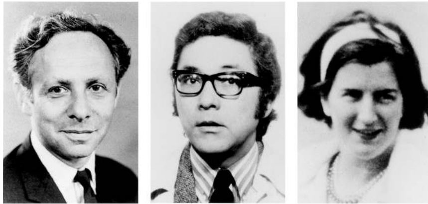
Fig. 1 Sir Anthony Epstein, Bert Achong, and Yvonne Barr