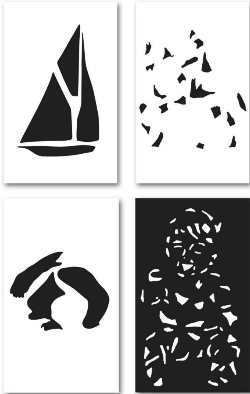
Fig. 3. Items from the Gestalt Completion Test (11). Identifying the pictures (from top-right to bottom left: a boat, a rider on a horse, a rabbit, a baby) requires visual abstraction. Participants were better at identifying pictures that they believed were sample items of a more distant future task (12) or a less likely task (13).