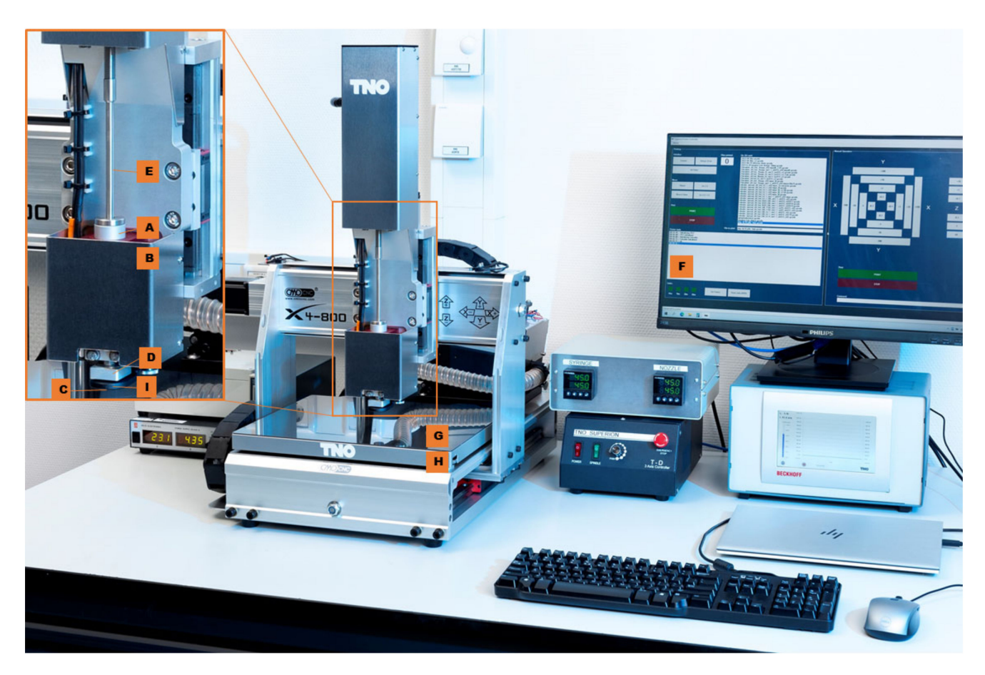
Figure 2. Used printer setup; syringe (A), the heating element of the syringe (B), nozzle (C), the heating element of the nozzle (D), piston (E), computer with Pronterface (F), printing platform (G), heating bed (H), and cooling (I).