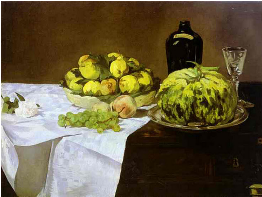
Edouard Manet, Still Life with Melon and Peaches. c. 1866

Assume I wish to convey to you why I am so unhappy, despite my smart job in a smart city, smart friends who adore me, and so on. I could simply list for you properties that I truly bear, for example, that I am forty-two, unfulfilled, alienated, and so on. But besides being tedious this is also a rather ineffective way of expressing what I wish to express, given the alternatives. So I opt for a bit of helpful figuration and instead offer a much more succinct kind of communication. Imagine that I say to you that ‘ this is what I have always wanted my life to be like,’ pointing to: