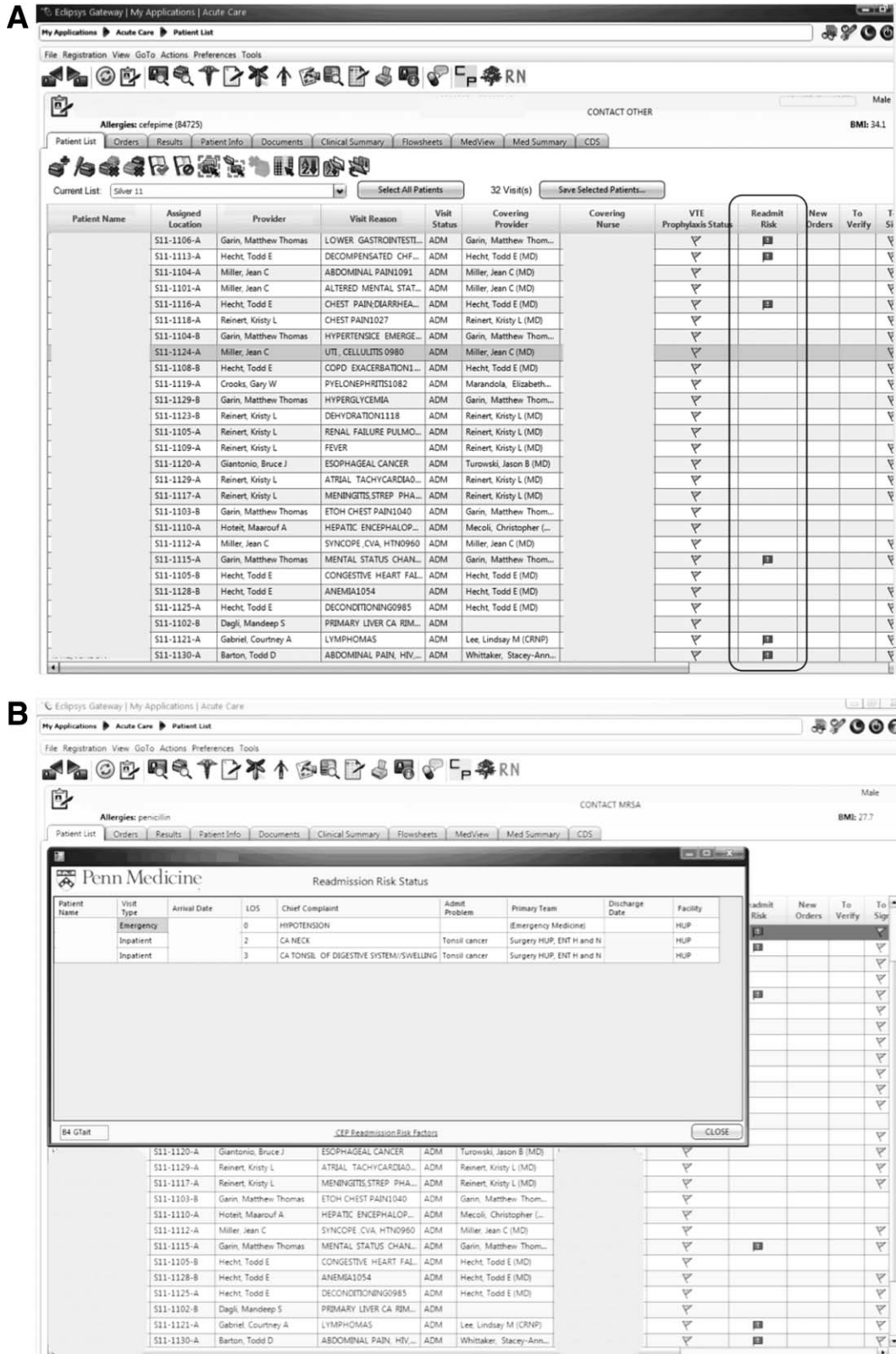
FIG. 1. (A) Screenshot of the electronic health record (EHR) with the readmission risk flag implemented and visible in the ninth column of the patient list. (B) A new screen with patient-specific information relevant to discharge planning can be accessed within the EHR by double-clicking a patient's risk flag.

effect). We used Cochrane-Orcutt estimation 21 to correct for serial autocorrelation.