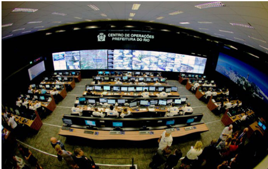
Fig. 1 The Centro De Operacoes Prefeitura Do Rio in Rio de Janeiro, Brazil.