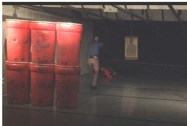
Figure 2. Dynamic scenario.