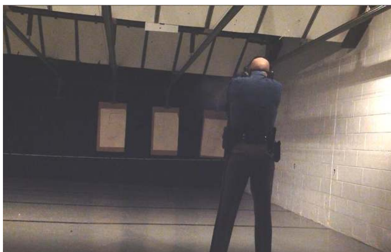
Figure 3. Positive identification task.

Officers wore their standard uniform and duty load throughout all three shooting scenarios to eliminate any variability that load carriage may have on their shooting performance or their physical endurance [18,24,25]. The total score was calculated by adding all three final scores together and dividing the total by three.