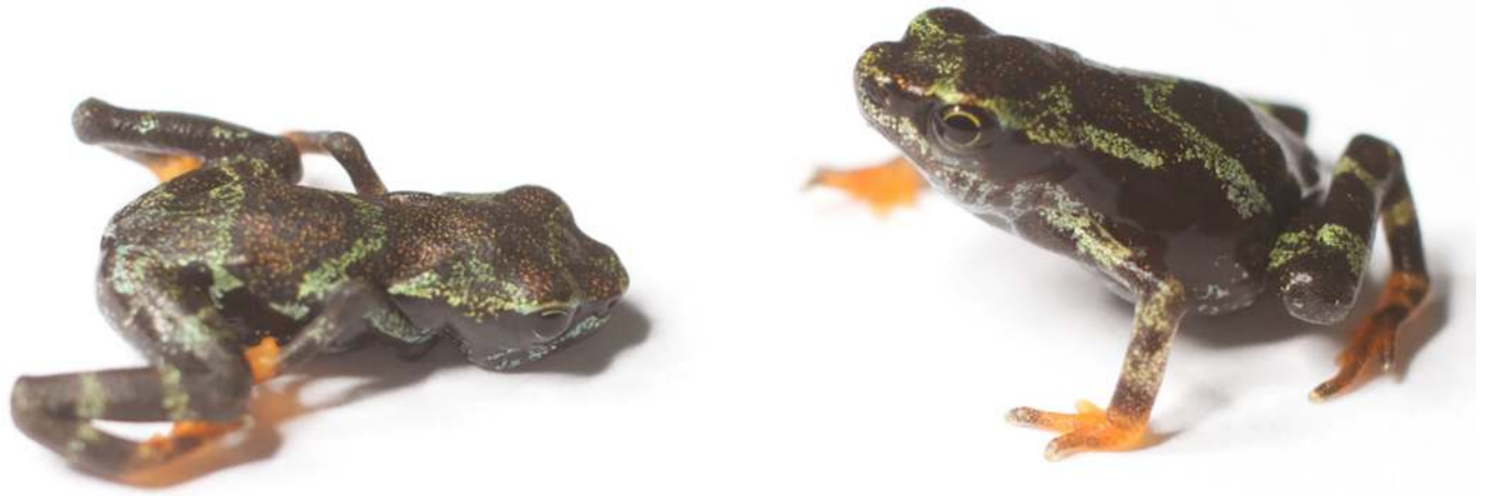
Fig 1. Atelopus certus post-metamorphs, an example of a SLS frog with poorly developed forelimbs (left) compared with a healthy froglet from the same clutch (right).

https://doi.org/10.1371/journal.pone.0204314.g001