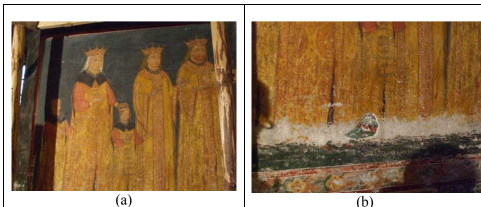
Figure 1. Pătrăuți votive painting: (a) Stephen's the Great family, (b) detail.

In the votive painting from Voroneț, made after 26 th of July 1496 [7] (date of death of Alexandru, son of Stephen), not similar to the one in Patrauti, the order of the character sequence is not the same. In the right side is portrayed Jesus sited on the throne, on his side Saint George has the role of intercessor, and in front of Him is found the voivode, followed by his daughter Maria, then his wife, Maria Voichița and his son, Bogdan. In contrast with the votive painting from Pătrăuți, Bogdan doesn't receive the same hierarchical importance in the painting, being placed the last in the characters' hierarchy, and also his physical resemblance with the prince is not so great.