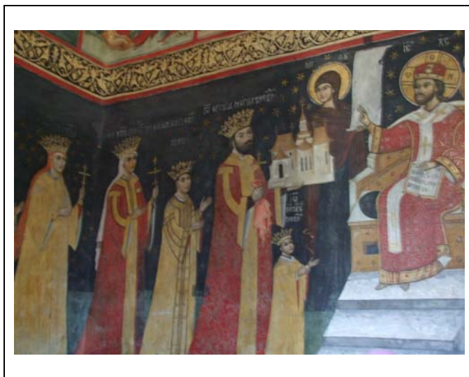
Figure 3. Votive painting from Sucevița cloister (detail)

During the rule of Ieremia Movilă appeared a new kind of stylistic approach that marked the transition from Moldavian art to modern art. The stylistic differences can be explained also by the change in the attitude of the ruler, Ieremia Movilă originating from boyars [11].